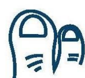
In children, purple markings on the fingers and toes